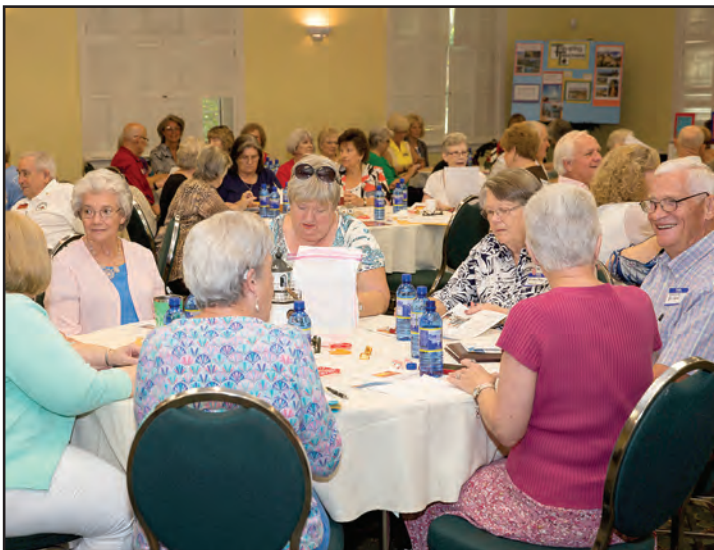
Areas 17 and 18