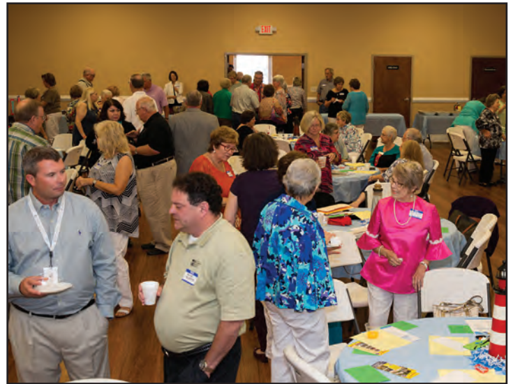
Areas 15 and 16