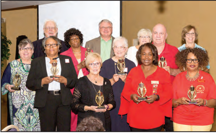
Areas 7 and 8