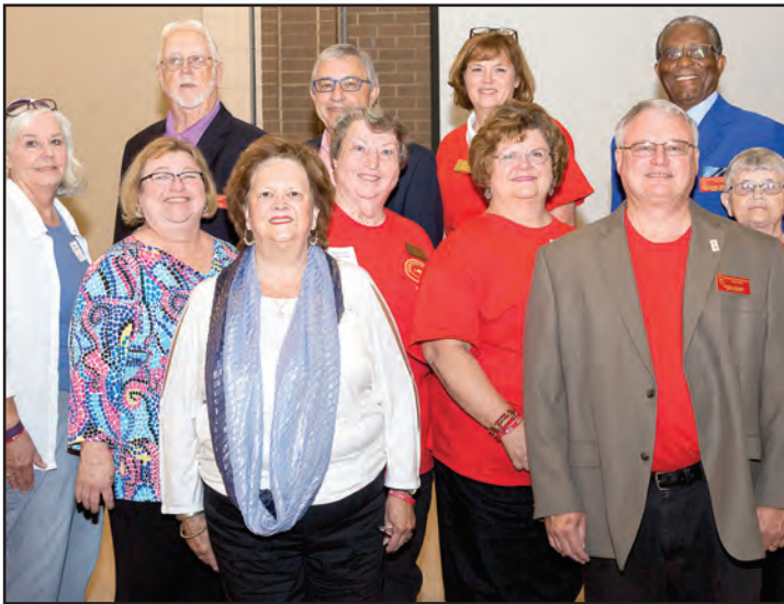
Areas 9 and 10