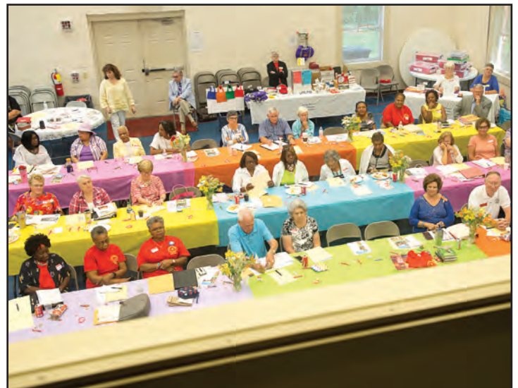
Areas 13 and 14