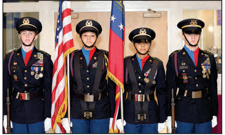
Areas 11 and 12