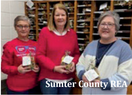
Sumter County REA