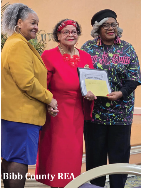
Bibb County REA