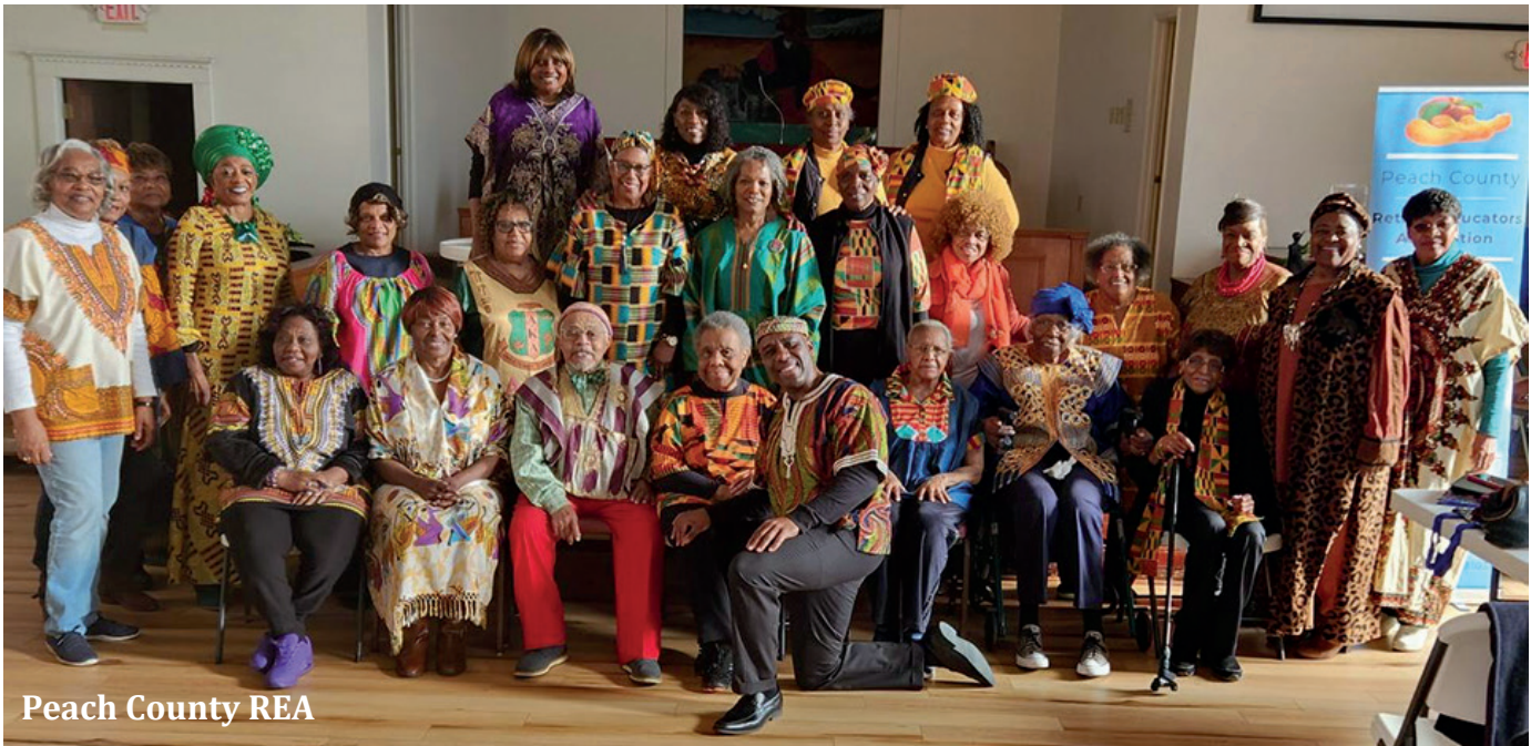
Peach County REA