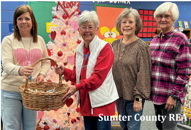
Sumter County REA