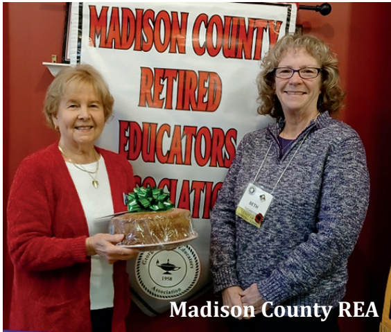
Madison County REA