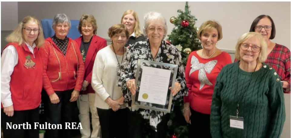
North Fulton REA