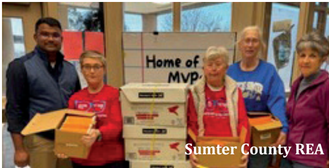
Sumter County REA