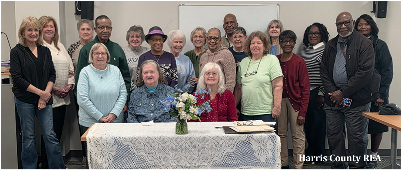
Harris County REA