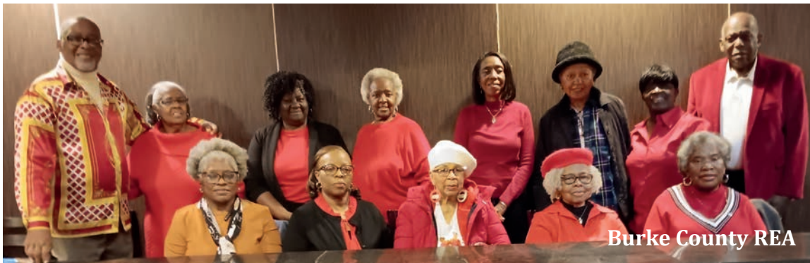
Burke County REA