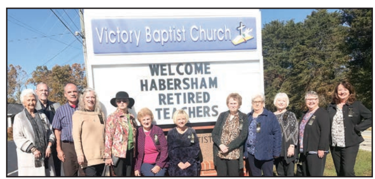
Habersham REA members attended the service at Victory Baptist Church in Clarkesville in recognition of Retired Educators Day. Several members attended their church and met at the restaurant. Attendees enjoyed fellowship and a buffet lunch at the Cornelia Food Factory after the service.