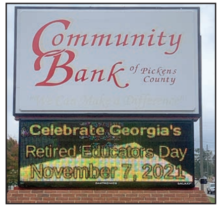
Pickens County REA: In Pickens County, along with wearing our ribbons, one of our local banks—Community Bank—celebrated us on their scrolling marque. They are always so supportive of our teachers—present and retired!!