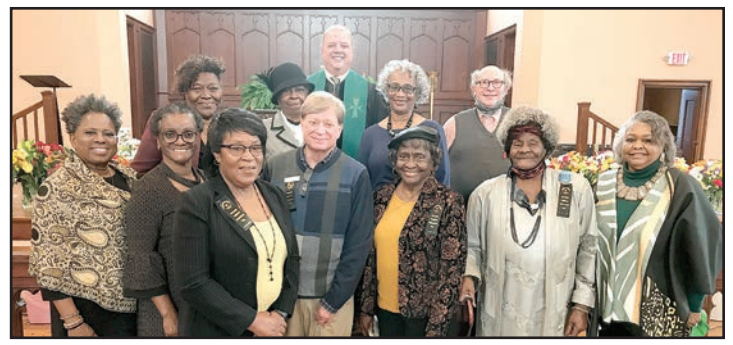
Chatham REA members at Sunday church service celebrating Georgia Retired Educators Day.