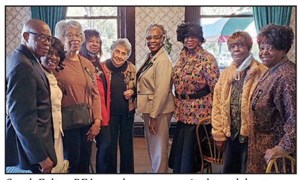
South Fulton REA members were excited to celebrate Georgia's Retired Educators Day on Sunday, November 7, 2021, in person at the Historic Green Manor Restaurant in Union City, Georgia since gatherings are now more permissible. The group enjoyed an afternoon of lunch and fellowship with each other and invited guests.