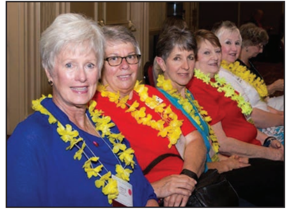
Our Sumter County Hostesses— 2019 GREA Convention—Tuesday