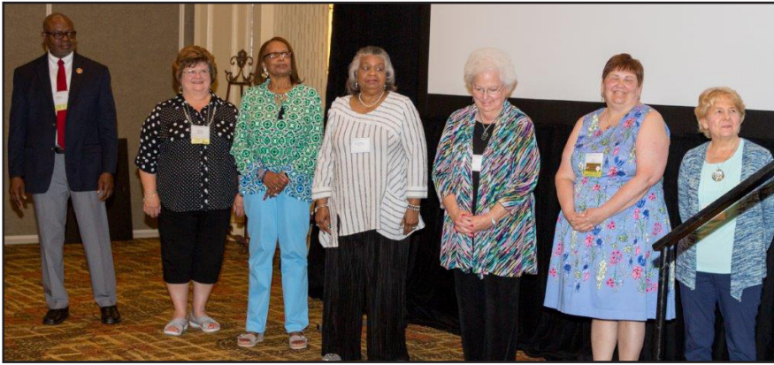
New board members—2019 GREA Convention—Thursday