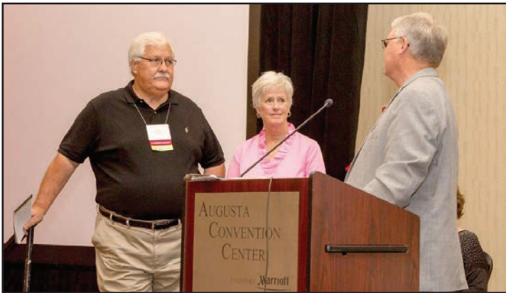
Thank You! Convention chairs—2019 GREA Convention—Thursday