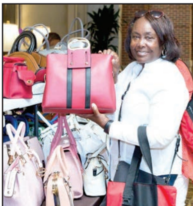
May I buy this purse? 2019 GREA Convention—Tuesday