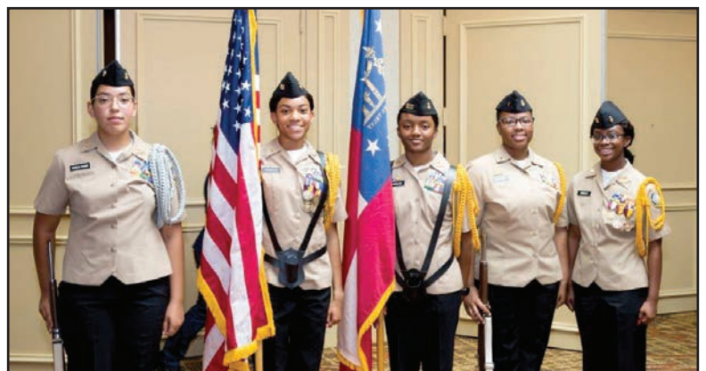
JROTC looking sharp (Richmond County)—2019 GREA Convention—Tuesday