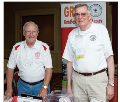
May we help you? 2019 GREA Convention—Tuesday