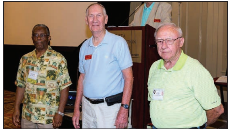
GREA Membership Directors—2019 GREA Convention—Thursday