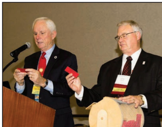
The Winner is...—2019 GREA Convention—Wednesday