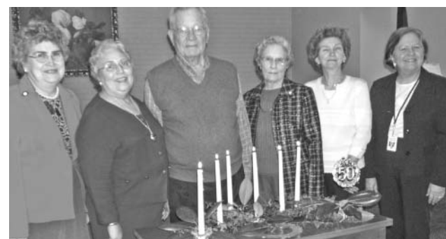
SUMTER REA CELEBRATES 50 YEARS OF GREA

We're seeking teachers, principals, and retired educators. Tutors are paid $30 per hour. Hours are flexible and at your discretion. For more information contact us: 866-835-3371 or online at PPLGA@pcgus.com .