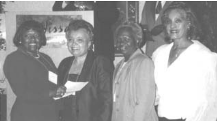
GREENE COUNTY REA Officers present door prize for stay at Ritz Carlton Hotel. Door prizes are a fun part of the convention. Thank you to all of the local units for your generous donations.