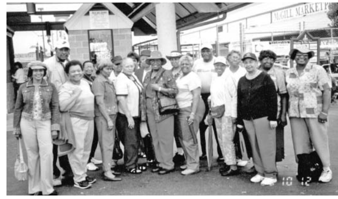
Peach Retired Educators group at the Georgia National Fair.